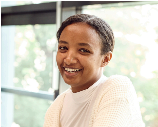
June 2025