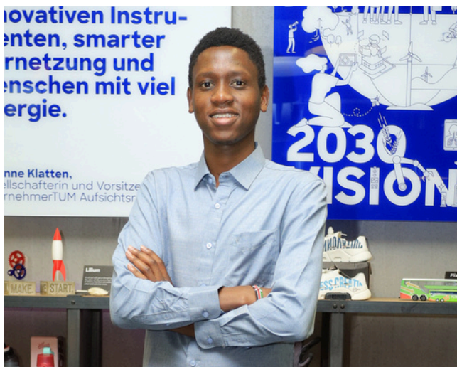
June 2025

Back home, I serve as vice leader of the Google Developers Groups at my university, motivating fellow students to develop their skills and collaborate on tech projects.