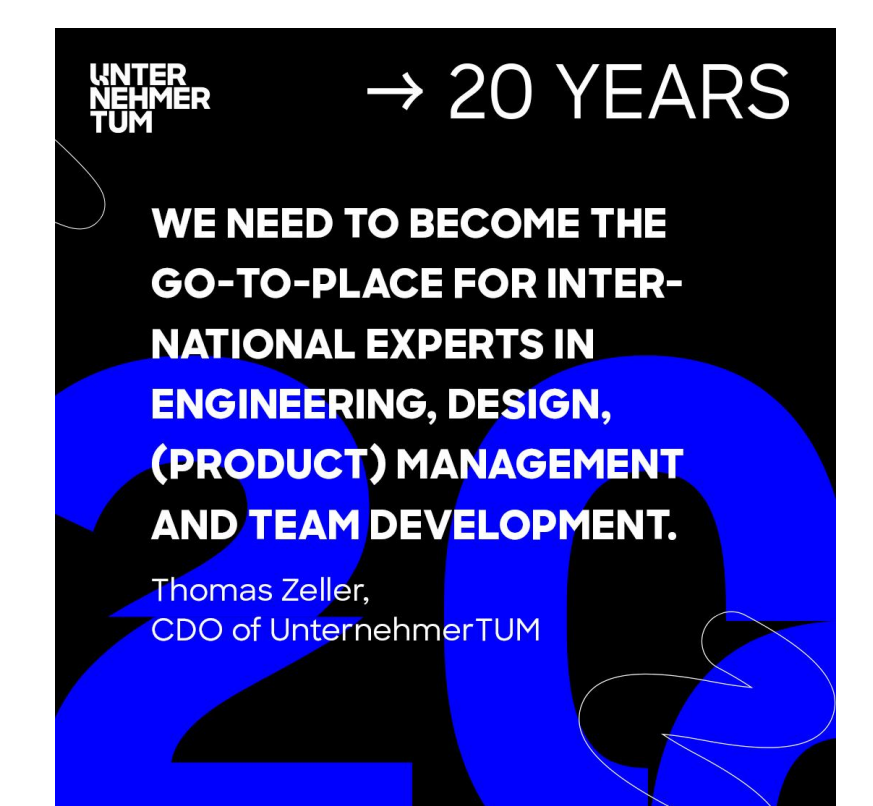
Template 5 - personal quote