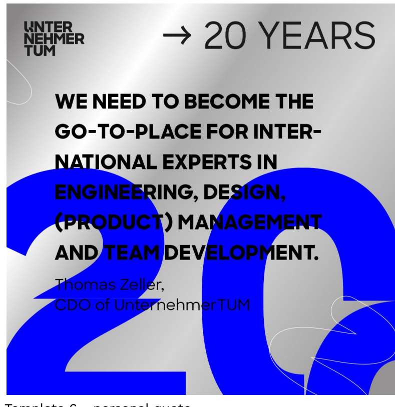
Template 6 - personal quote